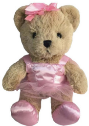
Ballerina Bear $18

Your order will be available for pickup at the recital (see the flower table upon arrival). Extras will be available to buy at the recital. Pre-orders are preferred and will guarantee your order.