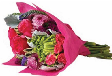
Mini-Mixed Posy Bouquet $20