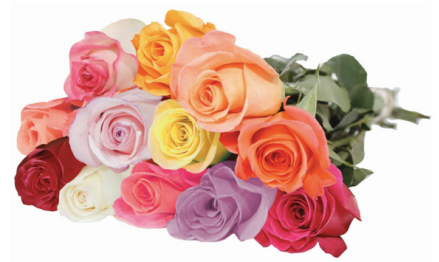
Long-Stem Rose Bouquet $23