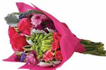
Mini-Mixed Posy Bouquet $20