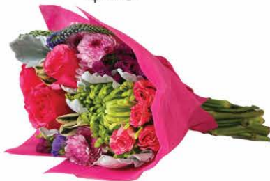
Bouquet & Bear Package Deal Package Discount Price 15% OFF —$38— $32