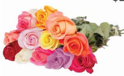
Bouquet & Bear Package Deal Package Discount Price 15% OFF —$40— $34