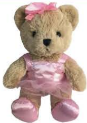
Ballerina Bear $18

Pre-order your gift at www.floracause.com/elevate